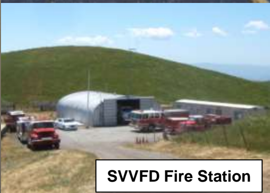
SVVFD Fire Station