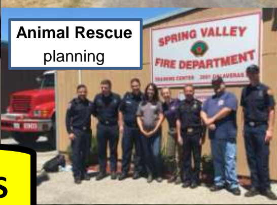
Animal Rescue planning