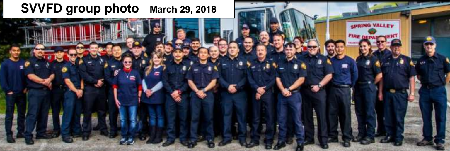
SVVFD group photo March 29, 2018